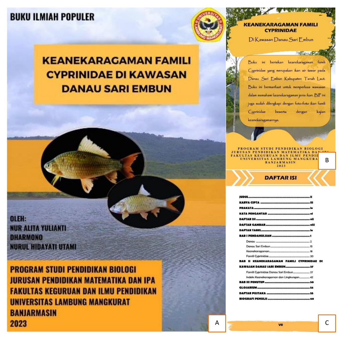
Figure 2 Design of (A) front cover, (B) back cover, and (C) table of contents (in Indonesian)

Based on the average validation results in Table 5 above, the PSBs developed are suitable for use in the field, as is done so that products in the form of PSBs can be better and can be used for further research. condition of improvement. This is done so that PSB products can be better used for further research. Good and feasible PSB products can be used as a benchmark for future research. This is in accordance with the validity contained in the teaching materials developed. According to Rahayu & Festiyed (2019), validity aims to measure the learning tools' validity. Validity is carried out by experts or practitioners who are experts in learning tools using validation sheets. According to the literature, overall, the PSB entitled "Turtles Supporting Life on Pulau Sembilan Kotabaru" was declared very valid because it was contextual in nature, had an attractive appearance, and used simple language so that students could more easily understand and learn the material according to the results of the validation by experts (Irwandi et al., 2019).